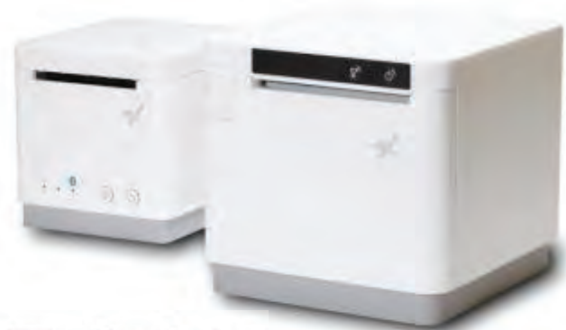
m C-Print3™ 80mm Receipts

Introducing two new and exciting “front-feed” printers for today’s multi-channel needs with 5 interfaces plus Hub functionality - All packaged in a compact and elegant design for your counter top solution