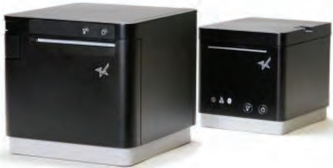
m C-Print2™ 58mm