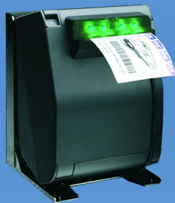
TSP700II with Guide