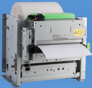
TUP500 / 900